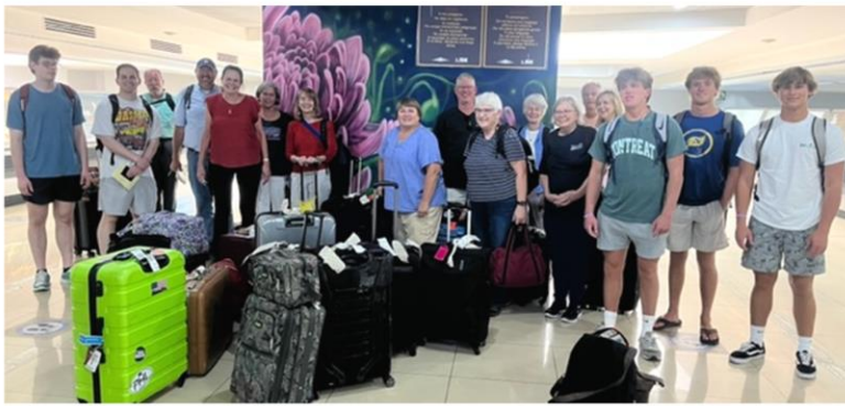
The flights were on time and not a single piece of luggage was lost!

The 2023 Guatemala mission team would like to thank the congregation for all your support. Thanks to your prayers and generous financial gifts we had a very successful trip. Both projects were very successful.