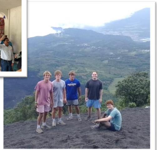
We could not have done this without our amazing youth.

If you are interested in seeing more pictures and details about the trip, please visit our blog https://goguatemala.home.blog