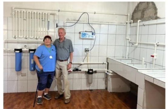
The water purification system is installed and working in San Carlos Alzate.