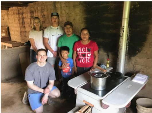
48 stoves were installed in homes in villages around San Carlos Alzate.